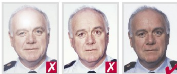
Flash Reflection Visible

The photo must be taken with a plain light-colored background.